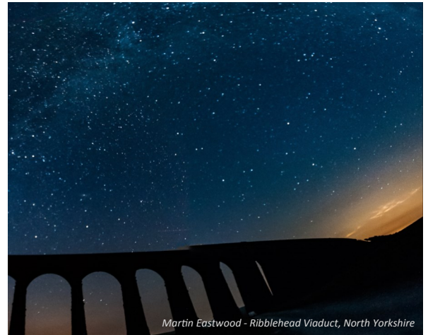
Martin Eastwood - Ribbleshead Viaduct, North Yorkshire