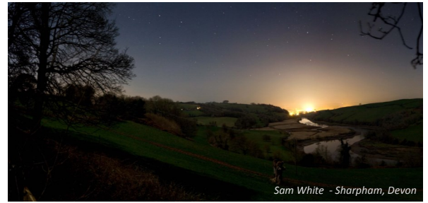
Sam White - Sharpham, Devon

CPRE would love to hear about these lessons and see examples of the students work. Please send letters, star count results, photos etc. to the details below.